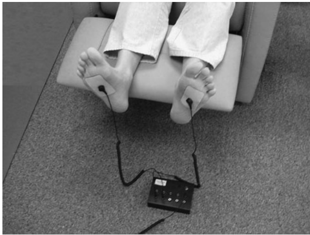
FIG. 1. Grounding system showing patches, wires, and box connecting to a ground rod planted outside through a switch (not shown) and a fuse (not shown). Similar patches and wires from the hands were also connected to the box to ground the hands.

For zeta potential calculations the Smoluchowski equation was used as follows 27 :